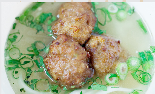
Pho Soup with Meatballs

Learn more today Call toll-free: 844.204.2847