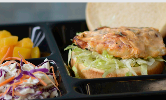
Grilled Buffalo Chicken Sandwich